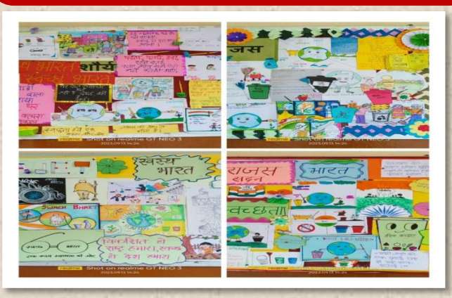
Har Ghar Tiranga